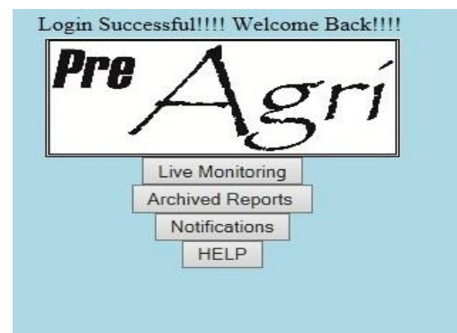
Fig 4 : System Interface