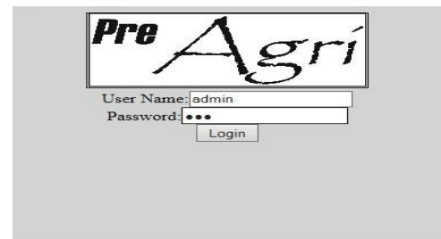
Fig 3 : User Authentication