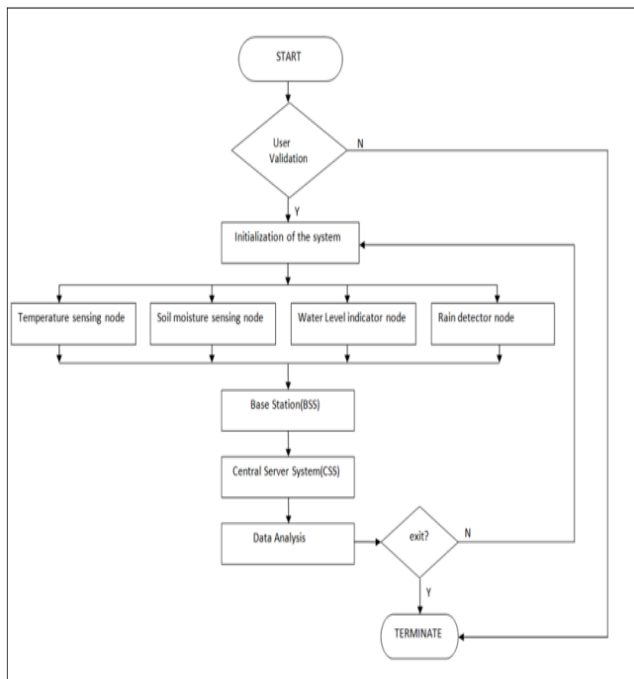
Fig 2 : Flow of Algorithm

The system will start its functioning as the user validation will occur with correct username and password. If username and password, neither of them matches, then the system will terminate. If username exists and the password is correct then the initialization of the system will take place, by initialization, it means that all the sensors in the field such as temperature sensor, soil moisture sensor, water level indicator sensor, rain detector sensor will be initialized to zero, hence refreshing the memory including data or archived values if any displayed. The data thus sensed by the sensors i.e temperature of the environment, soil moisture content, water level, possibility of rain, all these factors are sensed will be collected and transferred to the base server station located in the field. The base server station will further transfer the data to the central server system over a